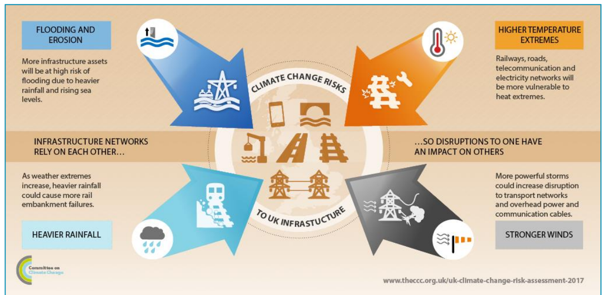
Figure 2: Image showing impact of climate extremes on UK infrastructure (Climate Change Committee, 2017)

The weather extremes described above can have a range of economic and social impacts on the residents, businesses, visitors and environment of Oldham and the surrounding areas. Warm weather events, like those experienced in 2022, are likely to increase in frequency, leading to localised droughts as well as increasing the risk of moorland fires. Similarly, the other extremes of wetter winters /colder temperatures, can cause significant travel and transport problems but also, and more damagingly, result in increased and greater flooding events. Figure 2 , below, shows the risks associated with climate extremes.